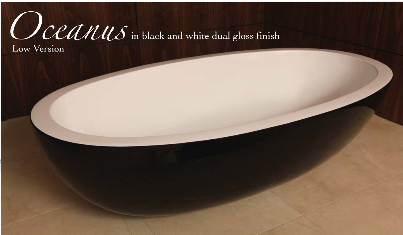
Oceanus in black and white dual gloss finish Low Version