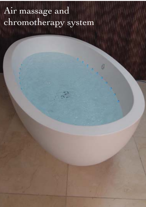
Air massage and chromotherapy system