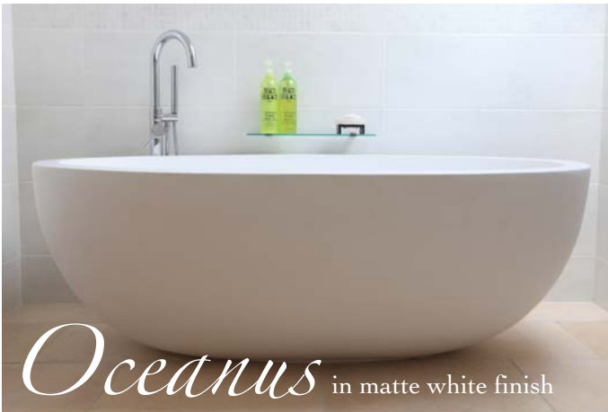
Oceanus in matte white finish